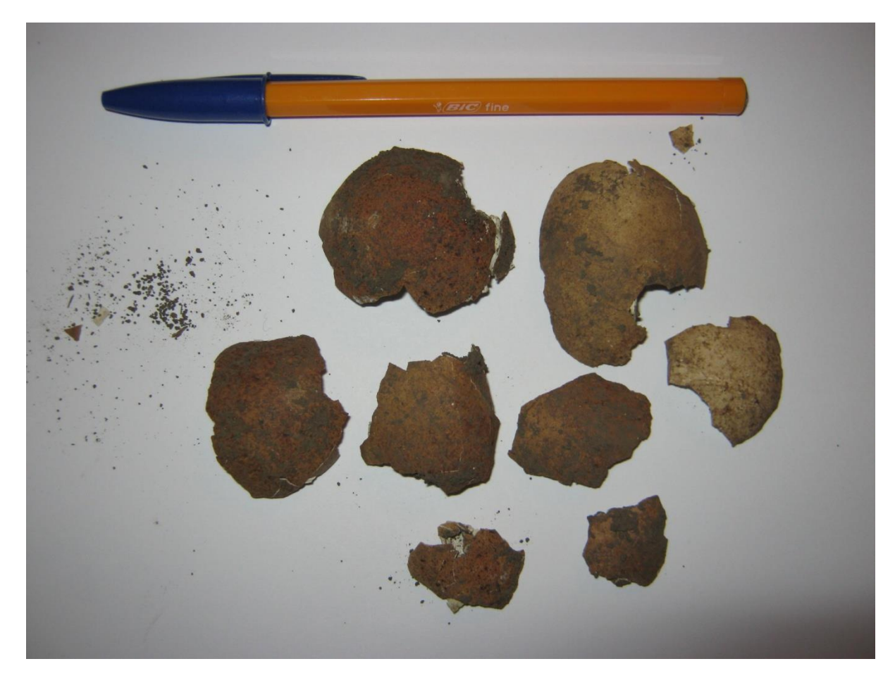
Brokken eggs of Saker Falcon

The LIFE09 NAT/HU/000384 project "Conservation of Falco cherrug in Northeast Bulgaria, Hungary, Romania and Slovakia" involving BirdLife Romania and "Milvus Group Bird and Nature Protection Association" aims to create favourable conditions and a steady growth of population in Central and Eastern Europe and to transfer the knowledge and experience of Hungarian and Slovak partners gained during the LIFE06 NAT/H/000096 project to Romanian and Bulgarian partners, for implementing the best practices for Saker Falcon conservation.