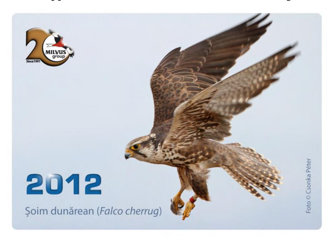
Saker Falcon (Falco cherrug)

BirdLife Romania is working with the public through media in order to support the conservation efforts of Falco cherrug .