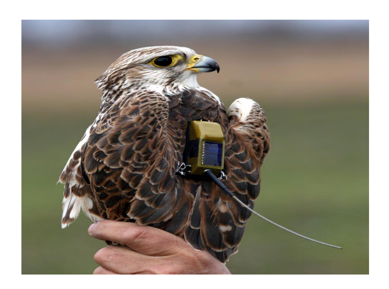
Tagging Saker Falcon (Falco cherrug) by PTT

The Agri-Environmental Working Group of the Ministry of Agriculture and Rural Development was contacted in order to introduce Saker Falcon specific measures into the agri-environmental scheme for 2014.