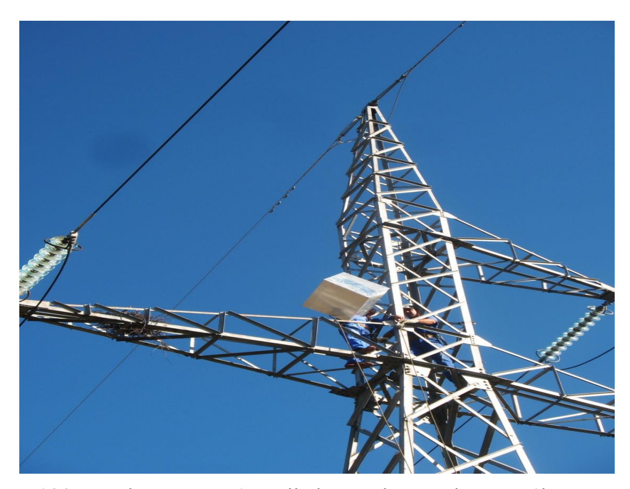
100 nest-boxes were installed on pylons

In Dobrudja region, the nest boxes were installed in the bordering area of ROSPA0073 Măcin-Niculițel, Babadag Forest, ROSPA0100 Stepa Casimcea and ROSPA0040 Old Danube - Brațul Măcin.