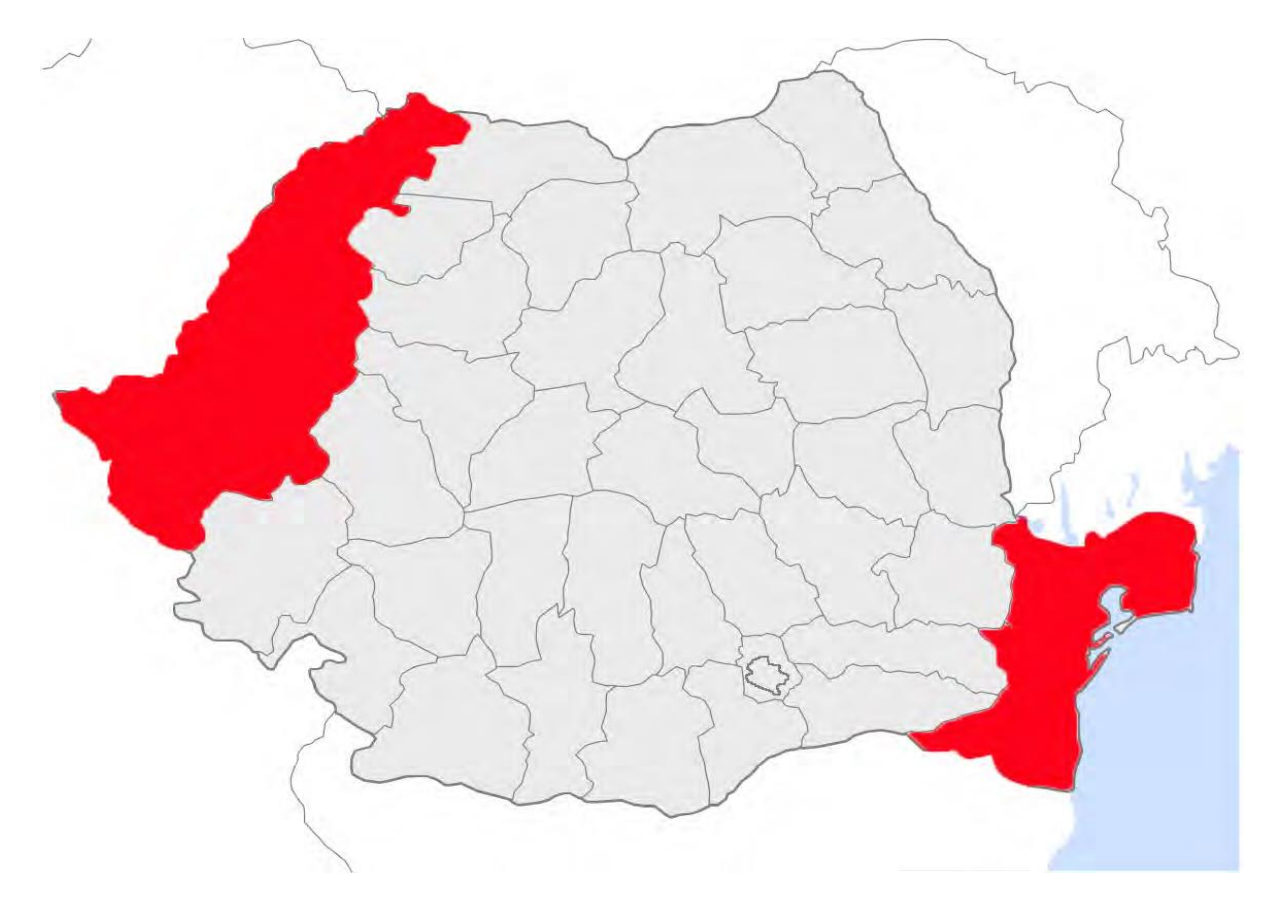
Distribution of Saker Falcon in Romania

Additionally one pair with flying young was observed suggesting probable breeding in the area (Babadag Forest on 11 July 2007). In 2008, four single birds were observed in the Danube Delta in February, May, June and July from three locations.