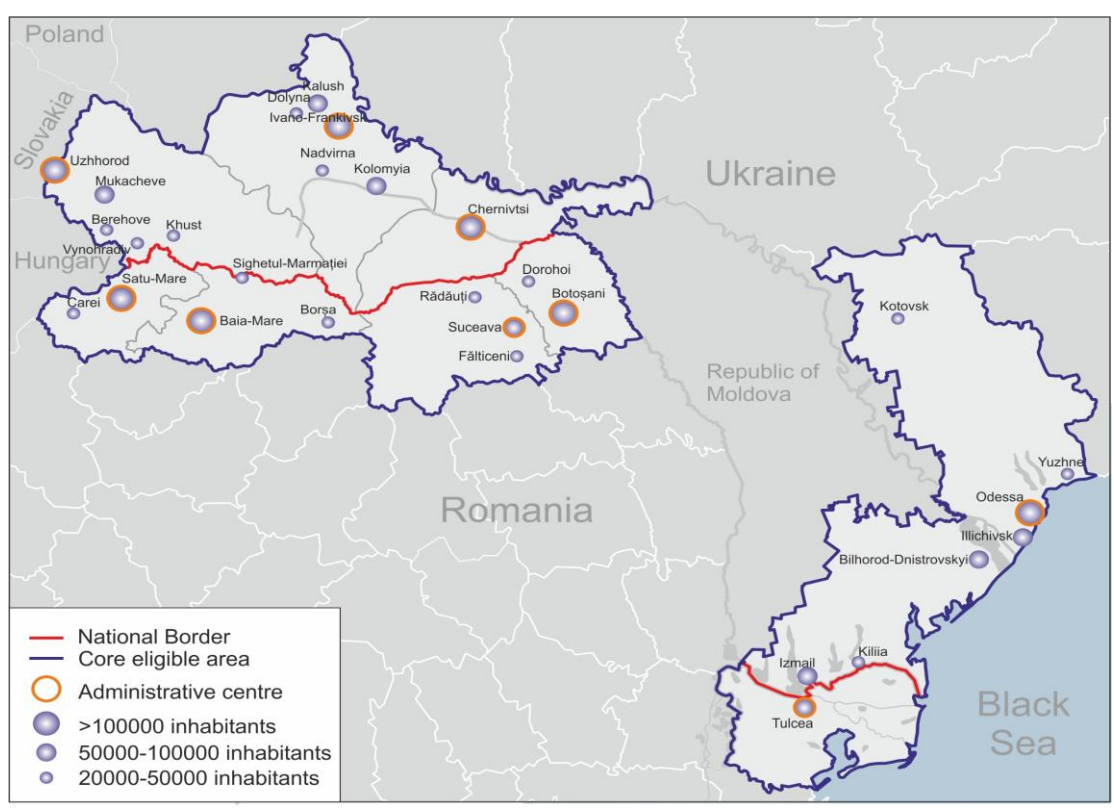
Figure 16: Main cities in the core eligible area by size of population

Moreover, the level of development of the infrastructure is not always consistent at territorial level. Urban localities have better connectivity to public utilities and services than rural ones. This is an important issue as with the exception of Maramureş County and Odessa Oblast, a large majority of the population still lives in rural localities.